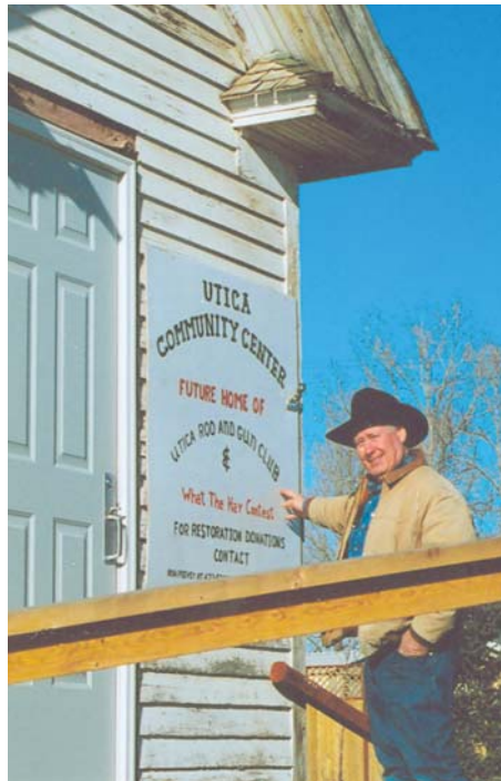
Top left: The center will rent to the general public for a modest fee and is already reserved for five days next summer. Top right: When completed, the 1,800-square foot hall will maintain its basketball court, foyer and stage. Bottom right: Volunteers joined the Rod and Gun Club members to roof, side, drywall and install windows.