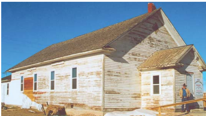
Built in 1916, this structure was always a community center.